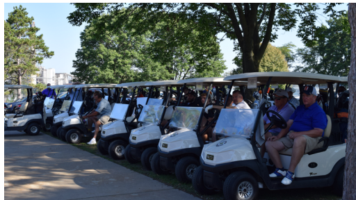
Golfers lined up and ready to go!